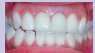
Porcelain Crowns & Veneers