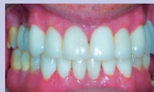
All Ceramic Crowns, Veneers & Implant Restoration