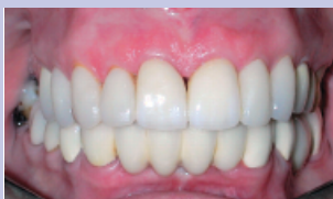
All Ceramic Crowns & Bridges