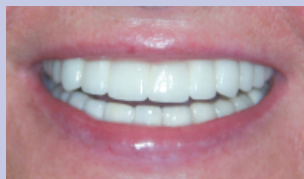
Implant Supported Upper & Lower Teeth