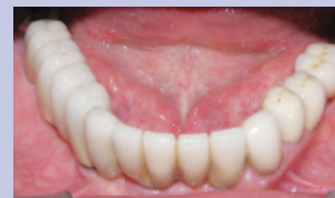
Implant Supported Full Lower Porcelain Teeth

EXCEPTIONAL QUALITY AND SERVICE TO OUR PATIENTS